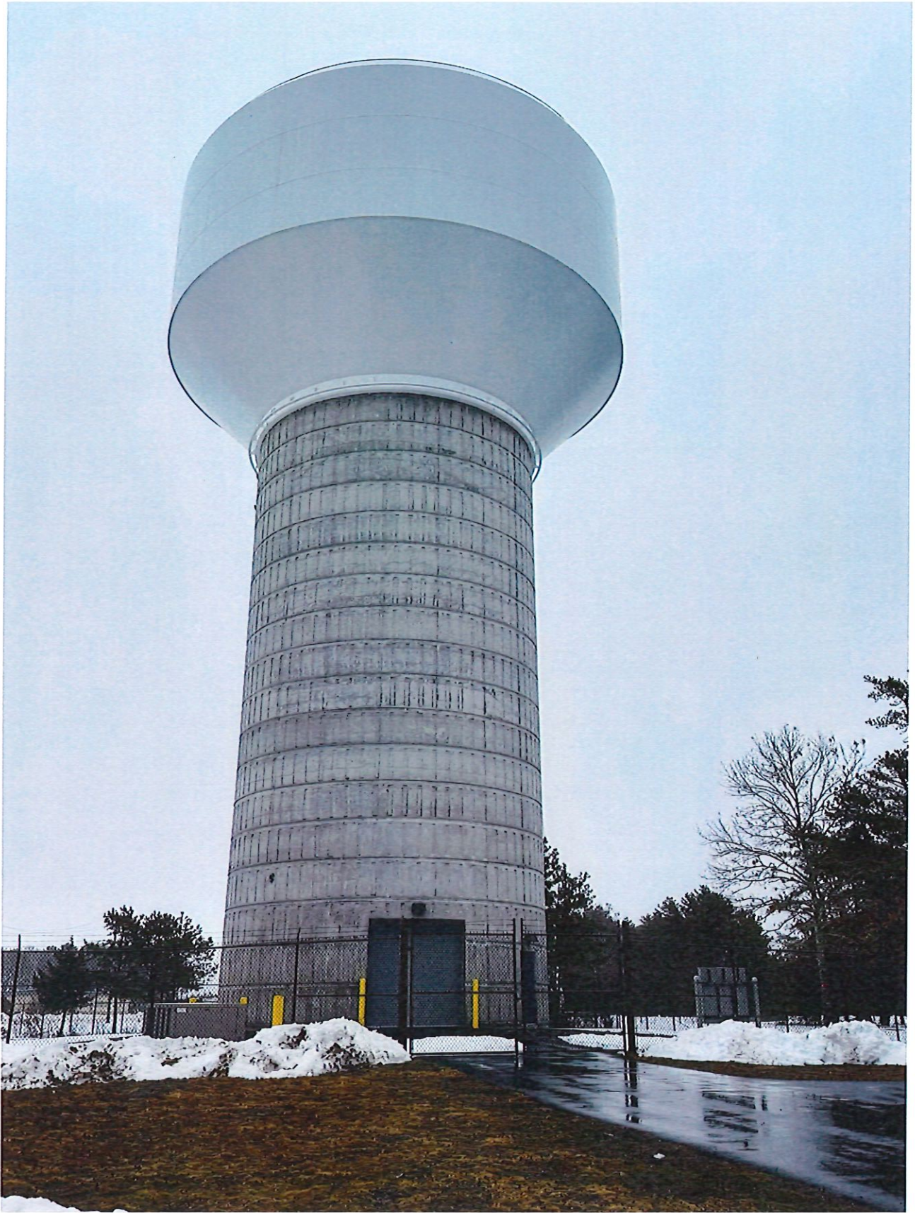
The new tank at Back Road